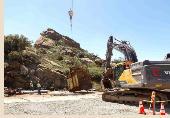
Workers look on as a crane moves an elevator car that was once used to transport workers to different levels of the test stand during historic operations.