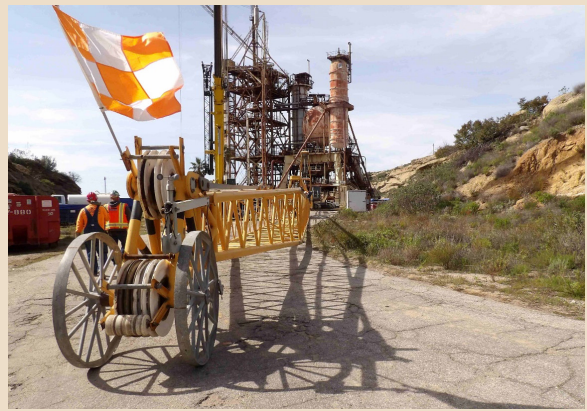
Demolition crews attach the boom (the telescopic arm used to lift heavy objects) to the crane.