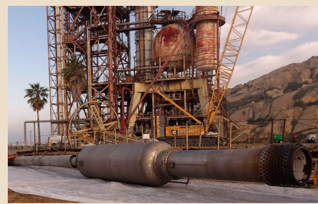
The flame stack that stood atop Coca Test Stand I sits in front of the structure following its removal.